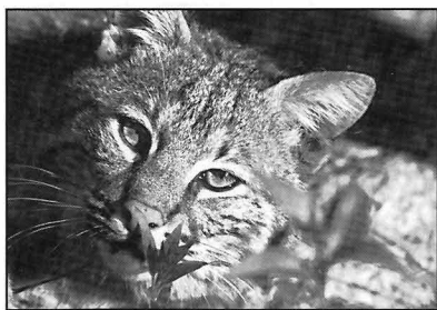
A close-up of a bobcat being nursed back to health at the Wild Ones Sanctuary.

she gets closer until she is able to make physical contact. Cats that have bonded with their natural mother are especially wary of humans, and often Shirley is unable